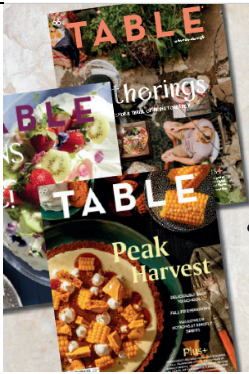
TABLE ® to Door

6X ANNUAL PRINT SUBSCRIPTION AS LOW AS $24.99 ANNUALLY